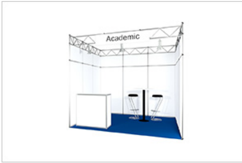
Exhibition stand for research institutions

Eligible for the LOPEC Start-up stand package are young innovative companies featuring new product or process developments. They should be in existence for less than 10 years, legally independent and have fewer than 50 employees.